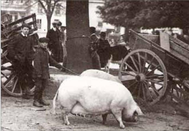
Fig 13 A Large White Ulster Pig at a fair in Castlewellan c1910. (Ulster Folk and Transport Museum WAG 1175, Courtesy of the Trustees of National Museums Northern Ireland).

native Irish Greyhound pigs with improved Dutch and Berkshire breeds, to develop their own distinctive Large White Ulster pig, which was formally established as a breed in 1907 20 (Fig. 13). It was claimed that ‘for early maturity and economy of production, high class flavour and quality of bacon’ the Large White Ulster was unsurpassed. 21 The Large White Ulster was also thin-skinned, however, which meant that live pigs could be easily bruised while being moved. This meant that until the mid twentieth century, pigs in Ulster tended to be slaughtered on the farm (Fig 14). Large White Ulster