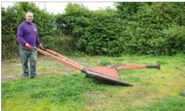
Fig 1 Wooden plough, with Oliver Curran, Down District Council, DB 88 DCM 1988-3.