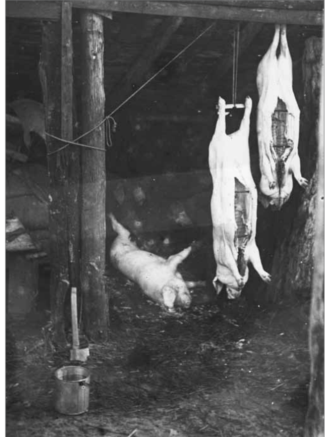
Fig 14 Slaughtered pigs with their innards removed. (DCM G05/87/14/241)

native Irish Greyhound pigs with improved Dutch and Berkshire breeds, to develop their own distinctive Large White Ulster pig, which was formally established as a breed in 1907 20 (Fig. 13). It was claimed that ‘for early maturity and economy of production, high class flavour and quality of bacon’ the Large White Ulster was unsurpassed. 21 The Large White Ulster was also thin-skinned, however, which meant that live pigs could be easily bruised while being moved. This meant that until the mid twentieth century, pigs in Ulster tended to be slaughtered on the farm (Fig 14). Large White Ulster