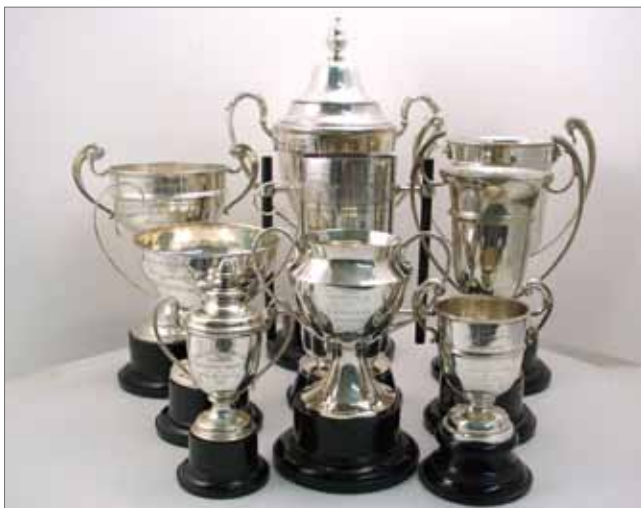
Fig 9 Trophies, Ardglass Young Farmers' Club, DB 142 DCM 1986-7/1-9.

The club was founded in 1932 and ceased operation in 1954.