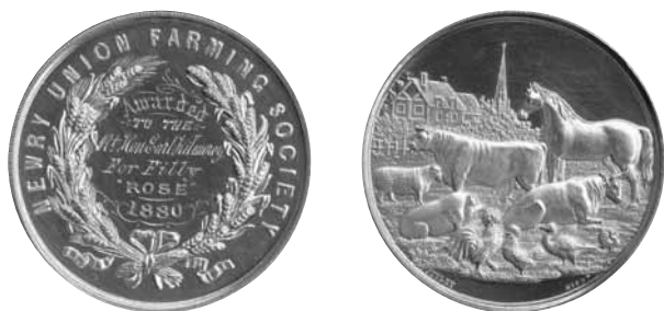
Fig 3 Medal awarded by the Newry Union Farming Society to the Rt Hon Earl Kilmorey, for Filly Rose, 1880, DB 1074 DCM 2004-167.

As the nineteenth century progressed into the twentieth, there was a change of fashion in agricultural prizes. While the medal has never disappeared, silver cups and