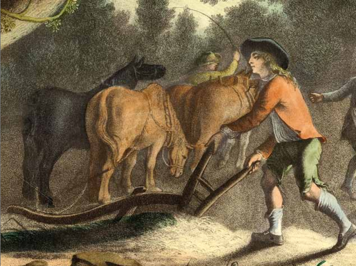
Fig 1 Ploughing near Hillsborough in 1783. The 'common' wooden plough is pulled by four native ponies known as 'garrons'. The collars and other parts of harness shown are made of twisted straw known as súgán . (W Hincks).