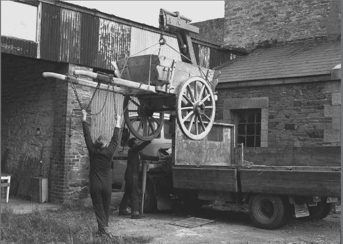
Fig 5 Unloading the cart from Annacloy, September 1983. DCM50/02/09