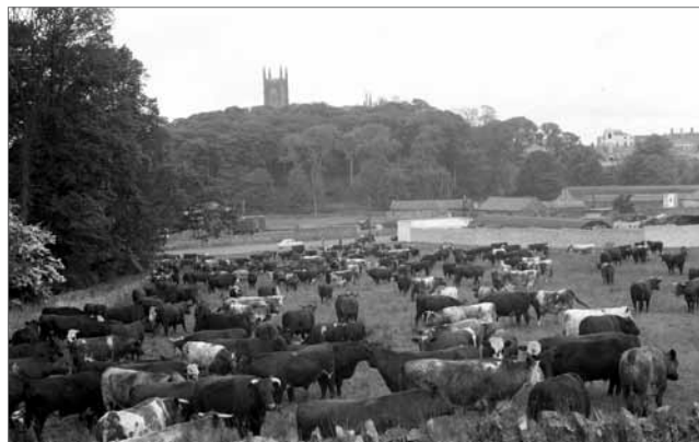
Fig 12 Cattle on the Fair Green in Downpatrick. Most of the cattle seem to be of a Shorthorn type. (DCM DJ05/41/312/01)

Pigs were kept on most small County Down farms. By the early nineteenth century, Ulster farmers had crossed