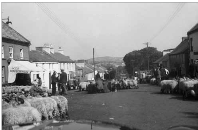
Fig 19 A sheep fair at Hilltown