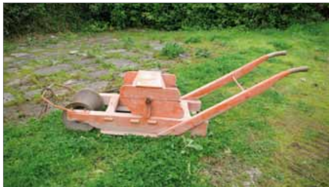
Fig 2 Wooden sower, DB 183 DCM 1988-33.

This was probably locally made. The sledge runners on each side of the sower meant that it could travel over raised drills without flattening them. The sowing