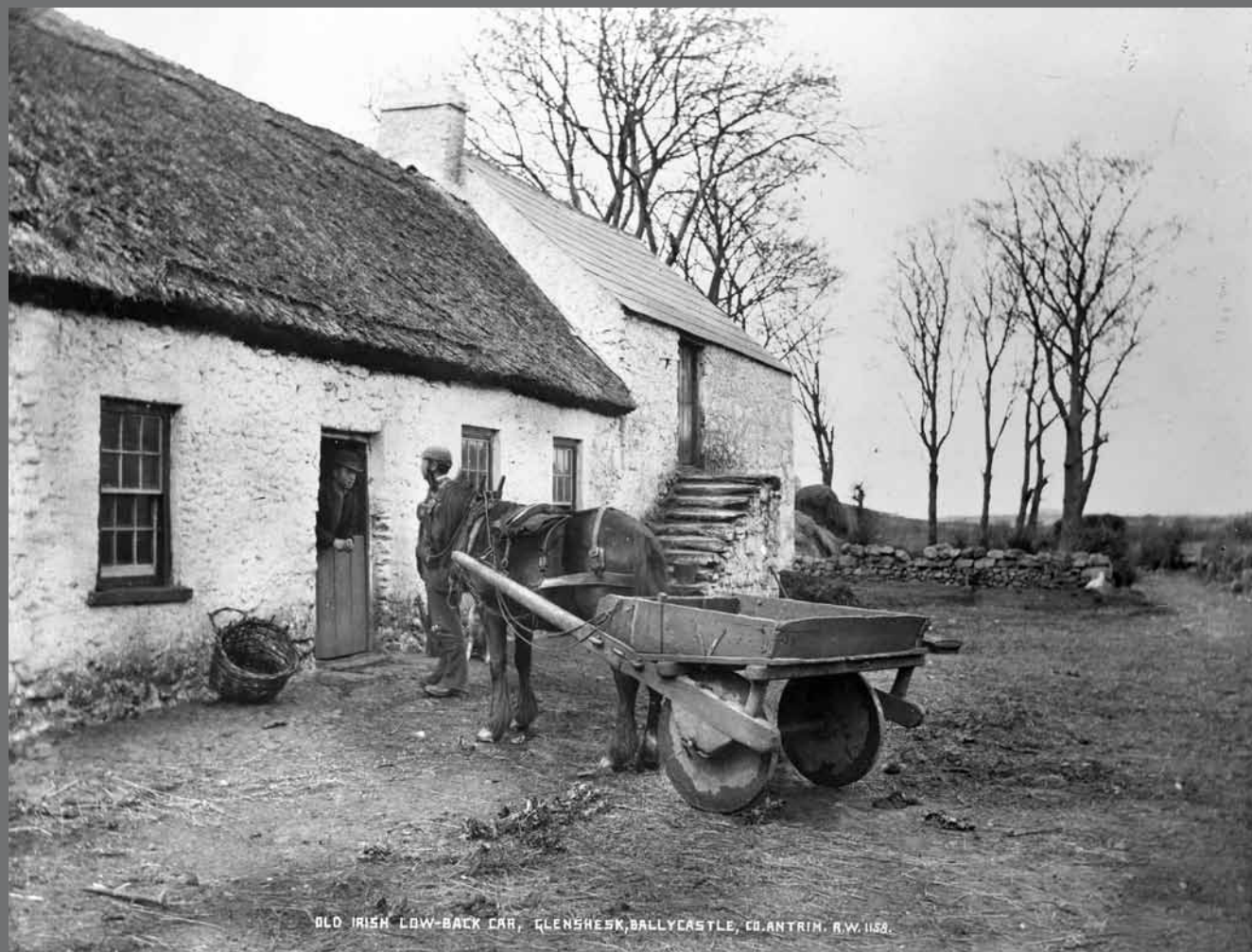
Fig 14 Block-wheeled car photographed in Glenshesk, north Antrim, circa 1900.