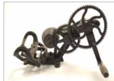
Fig 5 Sharpener for reaper blades, DB 92 DCM 1985-196.

Sharpener for reaper blades (Fig 5). Given by Mr N McCormick, Magherlagan, Downpatrick. DB 92 DCM 1985-196