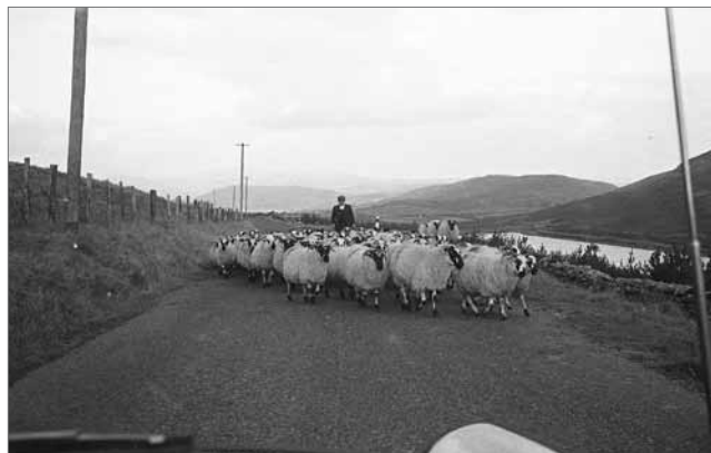
Fig 16 Flock of Mourne sheep near Spelga. (DCM DJ05/75/26/01)

Markets and fairs were the main means of trade for many rural people until well into the twentieth century. Markets depended on a regular (usually weekly) flow of trade, whereas fairs were seasonal or monthly, and more specialised. However, there was a large overlap in the activities carried on at both types of event.