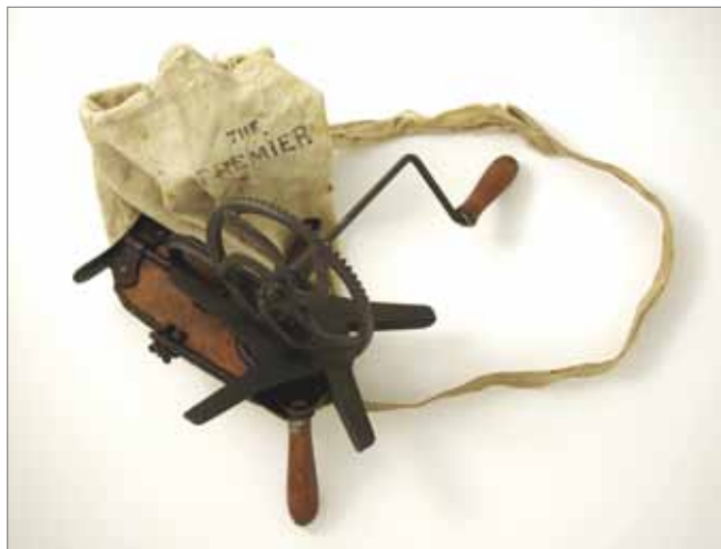
Fig 3 Corn sower, DB 100 DCM 1986-280.

The seed falling from the small sack was flung out by turning a handle rather than using a bow like the one above, which is much more common. The small size of this specimen suggests that it may have been used for sowing flax as well as (or rather than) corn.