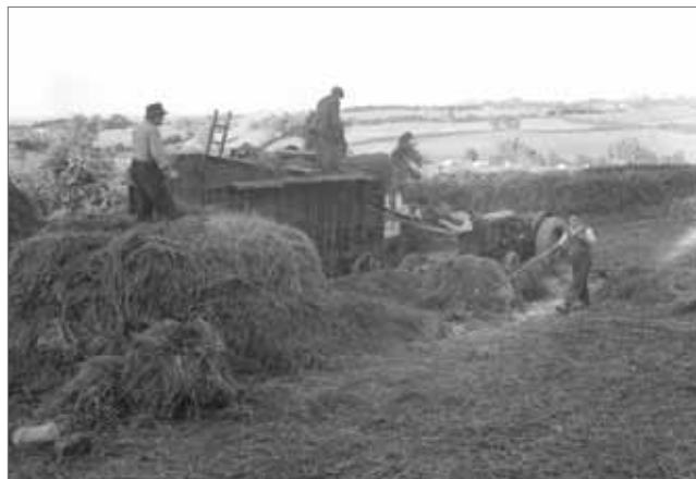
Fig 9 Mowing rye grass. Grass grown for hay should be cut before the seed ripens, but in the early twentieth century, the cultivation of grass for seed became important in Ulster. County Down produced half of the rye grass seed grown commercially. (DCM DJ05/43/03/07)

Scythes, probably introduced by the Anglo-Normans in the twelfth century, were also used for mowing grass to make hay. By 1900, hay was the biggest crop in Ireland, but by this time the introduction of horse drawn reaping machines was well under way. The production of grass seed was well established in the early twentieth century. By the 1960s, County Down produced half the rye grass seed grown in Ulster. 16 (Fig 9)