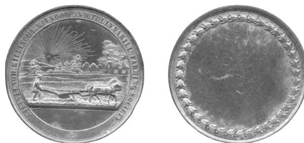
Fig 4 Medal awarded by the Killyleagh, Killinchy, Kilmood and Tullynakill Farming Society, DB 1081 DCM 2004-202.