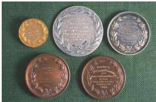
Fig 10 Medals awarded to Isabel McClenaghan of Rathfriland, DB 1080 DCM 2004-194 to 198