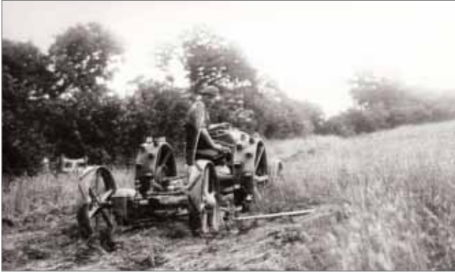
Fig 2 A Ferguson tractor reaping grain in 1938.

In the twentieth century, a County Down man, Harry Ferguson, was responsible for Ireland's most celebrated contribution to the development of farm machinery, the Ferguson tractor with its three point linkage and hydraulic lift (Fig 2). The Ferguson system allowed farmers to control implements attached to the back of the tractor, raising or lowering them, or moving them sideways as they drove. This transformed the tractor from an unwieldy 'iron horse' into the main source of power in crop production. Tractors incorporating the system were manufactured in 1936, and by the 1950s, the 'Wee Grey Fergie' was world famous.