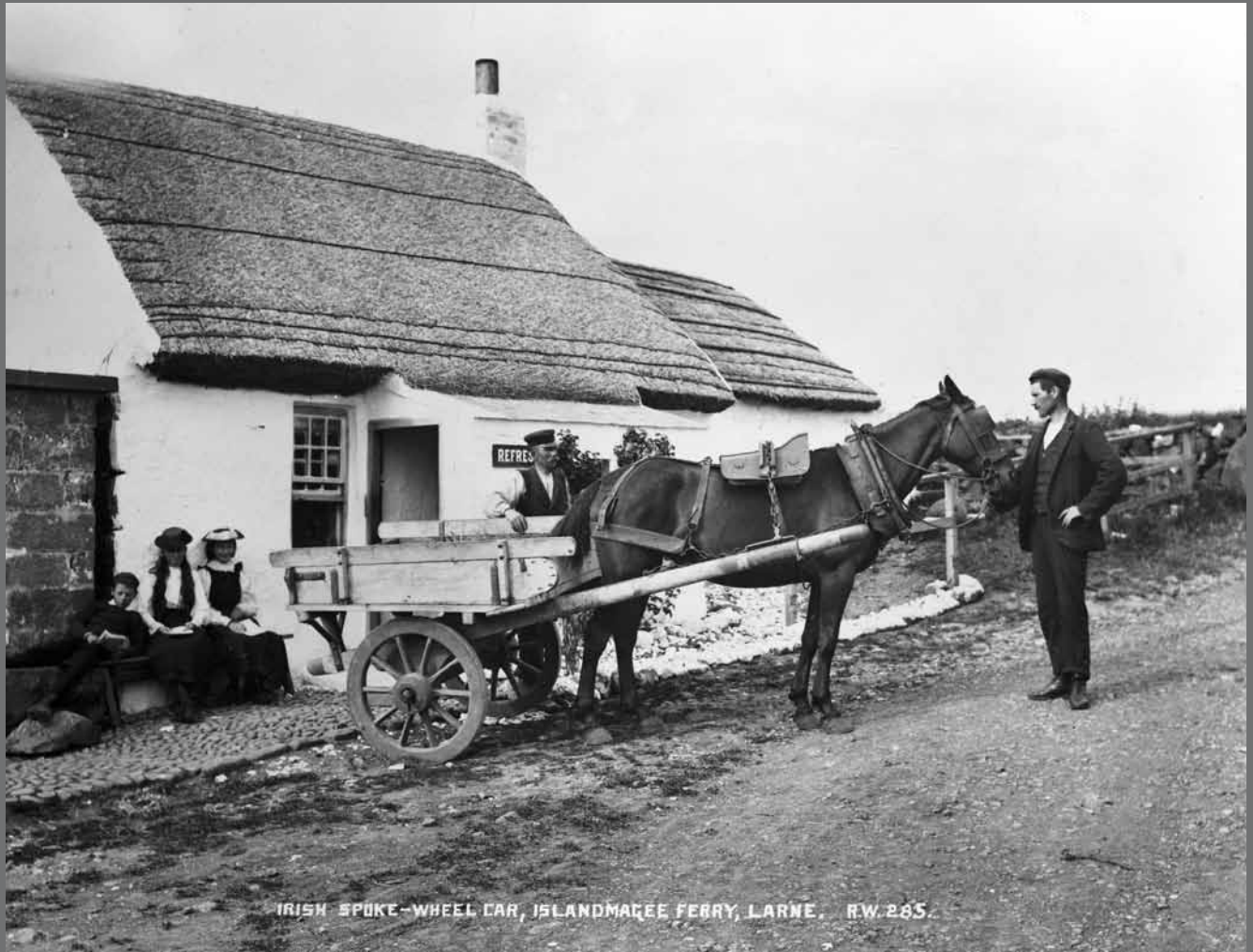
Fig 15 R J Welch photographed this spoke-wheeled trottler in Islandmagee, County Antrim. No historic photographs of County Down trottlers in use have yet come to light. National Museums Northern Ireland, W01-60-11.