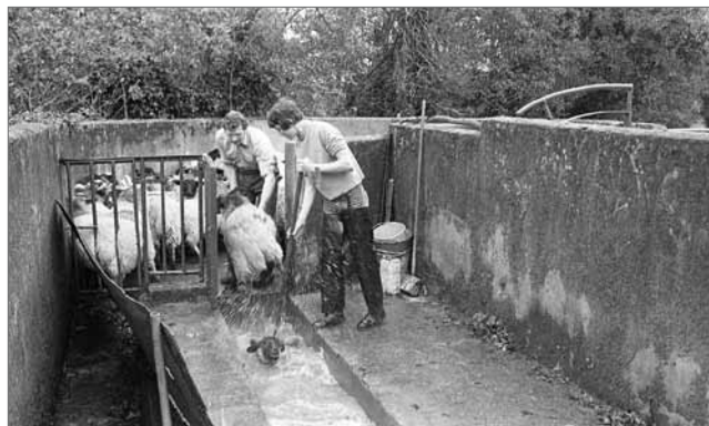
Students from the College on work experience in 1982, dipping sheep. DJ48/02/89/07.