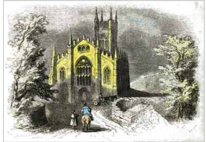
Fig 13 Nineteenth century engraving showing a block wheel car at Down Cathedral. DCM 1984-37

The Irish cart evolved from a platform placed between two parallel poles which were trailed along the ground by a pony, similar to a North-American Indian travois . This 'slide car' is an effective means of transport over rough ground and survived into the twentieth century in parts of Ulster. When the poles were raised on two wheels they became more recognisable as the shafts of a cart or 'car'. At first the wheels were solid (Fig 13), on a revolving axle, and subsequent development of wheel hubs, fixed axles, and spoked wheels resulted in the trottle car, a cart with small wheels and shafts which sloped low to the rear, requiring the body of the cart to be raised at the back to give a level platform. 3 It was only with the introduction of the farm cart with large wheels, the Scots cart, that the shafts became more or less horizontal when harnessed to the horse, and it was consequently unnecessary to level up the body of the cart at the back. 4 Before the introduction of the Scots carts the wheel cars, probably in various stages of evolution, were very numerous in County Down, being used for moving all kinds of burdens from place to