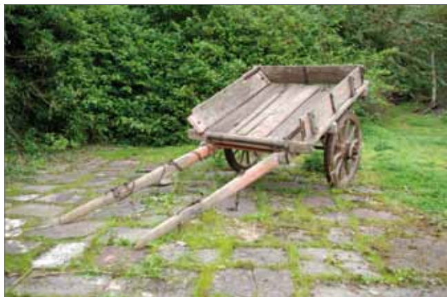
Fig 16 Trottle car in the museum collection, DB150 DCM1988-10.

very few examples, even of the later spoke-wheeled versions, have survived to be taken into museum collections. Fortunately, my knowledgeable and persistent friend, W F Jackson, managed to locate several trottle cars in mid Down, of which three, somewhat the worse for wear, were taken into the collection. 5 They had survived a bit like horse-powered wheelbarrows, doing humble and almost unseen tasks about the farm, such as carrying dung to the fields for fertilizer (Fig 16). As Wilbur Douglas of Ballykine told us, “The trottle cars were never off the farm, but the big carts were kept good for going into town.”