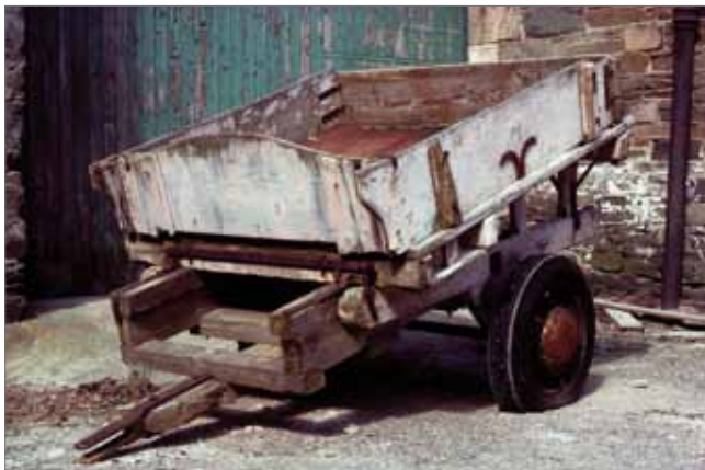
Fig 7 Converted truckle car, DB 145 DCM 1988-9.