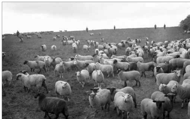
Fig 15 A flock of sheep at Ballydugan, photographed by D J McNeill. (DCM DJ05/41/857/03)

Sheep, like other livestock, increased greatly in numbers in the lowlands of County Down from the mid nineteenth century (Fig 15). However, the most distinctive type of sheep in the county were found in the Mountains of Mourne (Fig 16). Mourne sheep were recognised as distinctive as early as 1802, when they were described as 'very finely made in all points, finely woolled and much