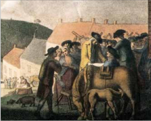
Fig 17 A linen fair in Banbridge, in 1783. (W Hincks)

Markets were held in many County Down towns. Downpatrick market, for example, was held every Saturday, and in the 1830s and 1840s it was described as well supplied with provisions of all kinds. 25 By this time also, several ports in the county were exporting agricultural produce. From the Downpatrick area, wheat, barley, oats, cattle, pigs and potatoes were exported from the Quoile quay, and from Newcastle, oats, barley and potatoes, 'of which large quantities are sent to Dublin and Liverpool.' 26