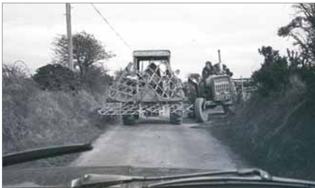
Farmers meeting on a country lane, probably near Ardglass. This is typical of D J McNeill's opportunistic photography – he didn't even stop to get out of the car but simply photographed his subjects through the windscreen! DJ05/03/78/02

headquarters is based in an eighteenth century gaol there is no appropriate display space for such material within the current site, as it has been developed. The model farm in the country park at Delamont was identified some years ago as a more suitable option but these plans were not implemented. However, we do have the advantage, and potential, of a garden at the rear of the site where there is space to design and build a display gallery specifically for the most important objects in this collection. We hope that this book will demonstrate the significance of our collection and support the case for developing such a purpose built gallery for its permanent display. In the meantime, a temporary exhibition, open