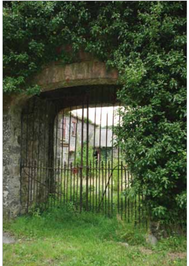
Fig 11 The model farm buildings at Delamont, photographed in 2009.

Despite the apparently conventional collection of obsolete agricultural implements in a rural area I hope it has been shown that, as well as the intrinsic significance of the