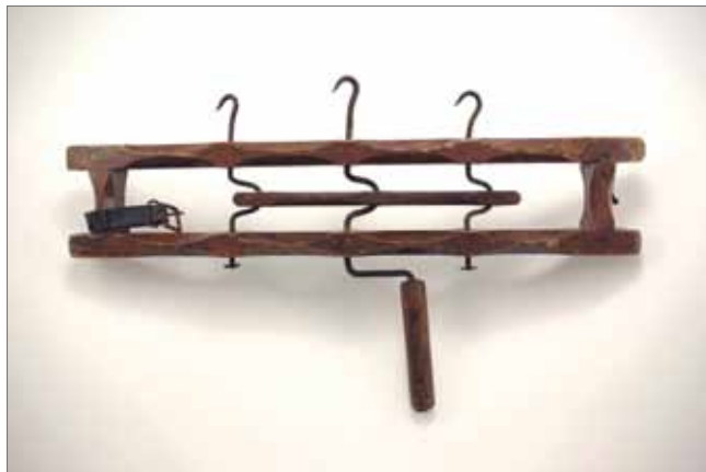
Fig 6 Rope twister, DB 136 DCM 1986-397.

This rope twister was constructed to twist three ropes at the same time. The three hooks are fitted to a rectangular wooden frame, on the other side of which is a handle for turning the ropes. It was found on a farm at Ballykinler.