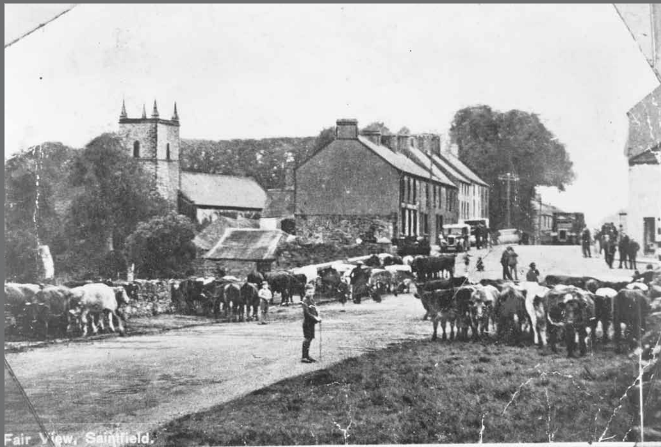
Fair View, Saintfield.