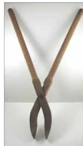
Fig 4 Wooden weed pullers, DB 253 DCM 2009-66.