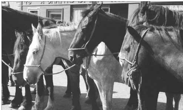
Fig 18 The horse fair at Banbridge, photographed by Pat Hudson in 1944. (DCM H05/12/01)

Fairs in general were organised to meet the changing needs of regions within the county. For example, in 1837, the main fairs in Hilltown were for linen yarn and cattle. 30 At this time, the nearby uplands of the Mourne mountains were used as summer pastures for cattle. Later in the century, however, sheep numbers began to increase very rapidly, and by the 1880s, sheep rather than cattle were kept on the mountains. In the twentieth century, the Mournes were nearly all common grazing for sheep. 31 The fairs in Hilltown reflected this development, and the best known fairs, held in August, September and October, were for the sale of sheep (Fig.19). At the 'Tup Fair' in September, as late as the 1970s, a ram was brought on to stage at a dance organised on the evening