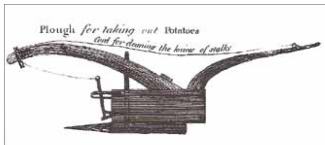
Fig 6 Wooden drill plough, illustrated in Dubordieu, John A Statistical Survey of County Down (Dublin, 1802), p52.

Farmers in the Mourne area also developed their own ingenious modification of older wooden ploughs, so that they could be used to make drills. A block of wood, known as a 'false reest' was attached to the flat 'land' side of the plough. This created a two-sided plough that could be used to push soil into drills. These dual-purpose ploughs were used in the Mournes well into the twentieth century (Fig 7). Later Mourne ploughs were used only to make drills, but their early history as ploughs