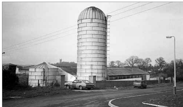
Fig 12 An example of modern farming - Lord Dunleath's silo on the Vianstown Road. Photographed by D J McNeill, winter 1984. DCM DJ 05/41/838/05

Within the museum collection there may also be objects of more than ordinary significance in themselves. In 1980, for example, it was thought possible that the east