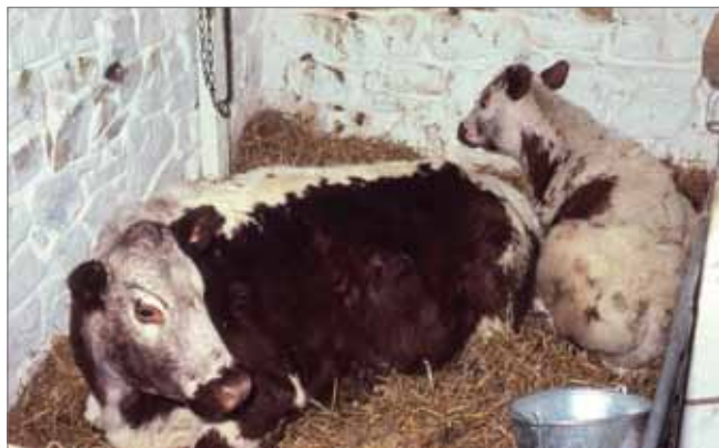
Fig 11 Irish Moiled Cattle at the Ulster Folk and Transport Museum, Cultra, County Down.